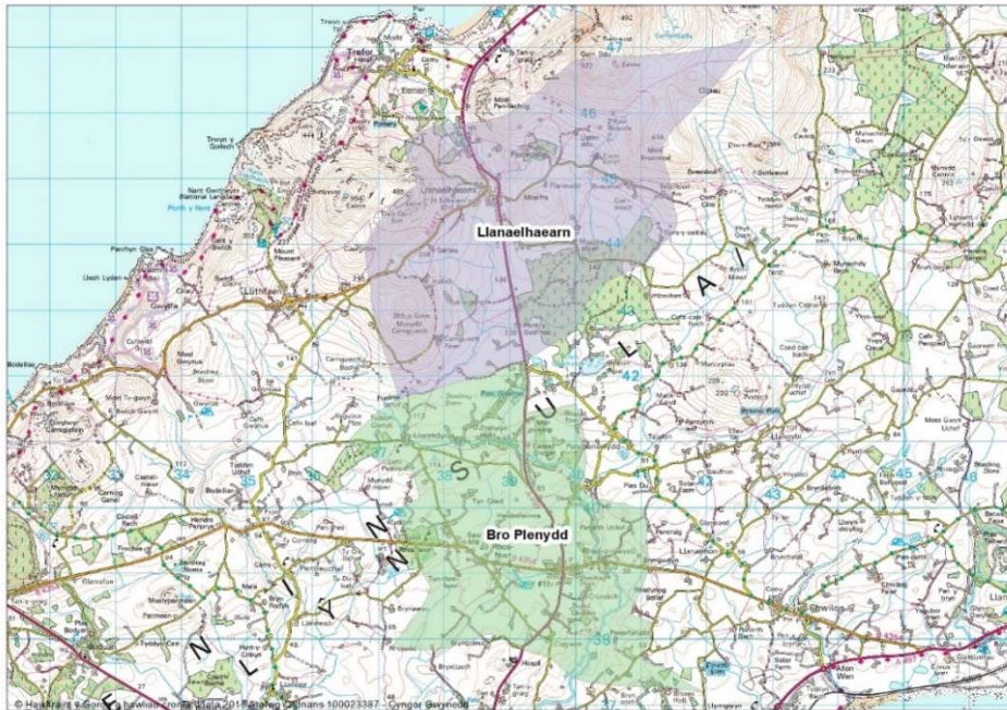
Map 2: Ysgol Bro Plenydd catchment area if changes take place